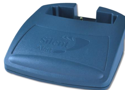
Basic Bedside Charger