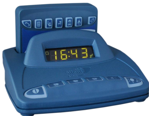
Alarm Clock Charger